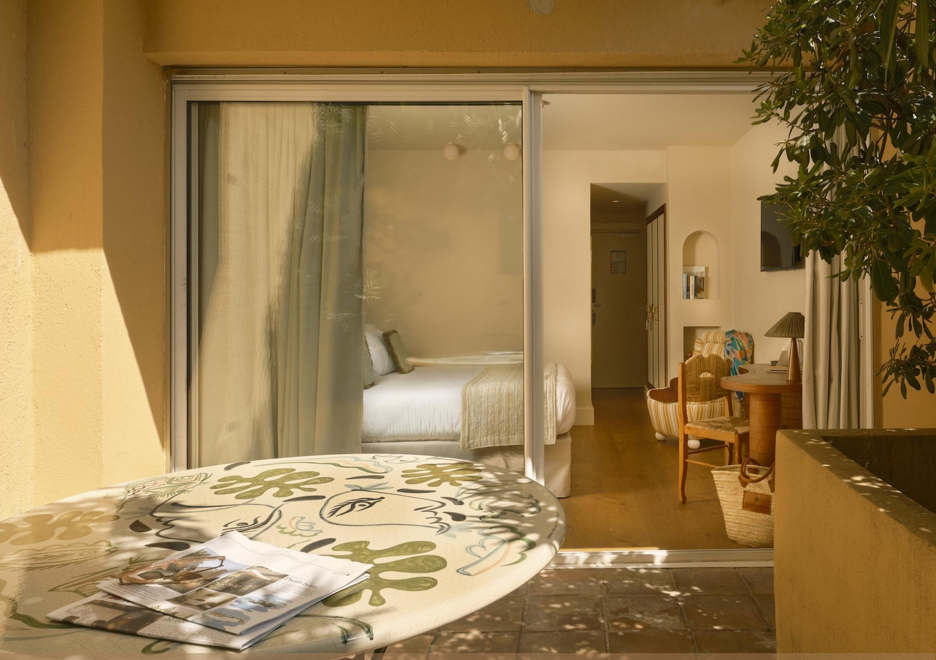
SUPERIOR courtyard view with balcony – 20 sqm / 215 sqf