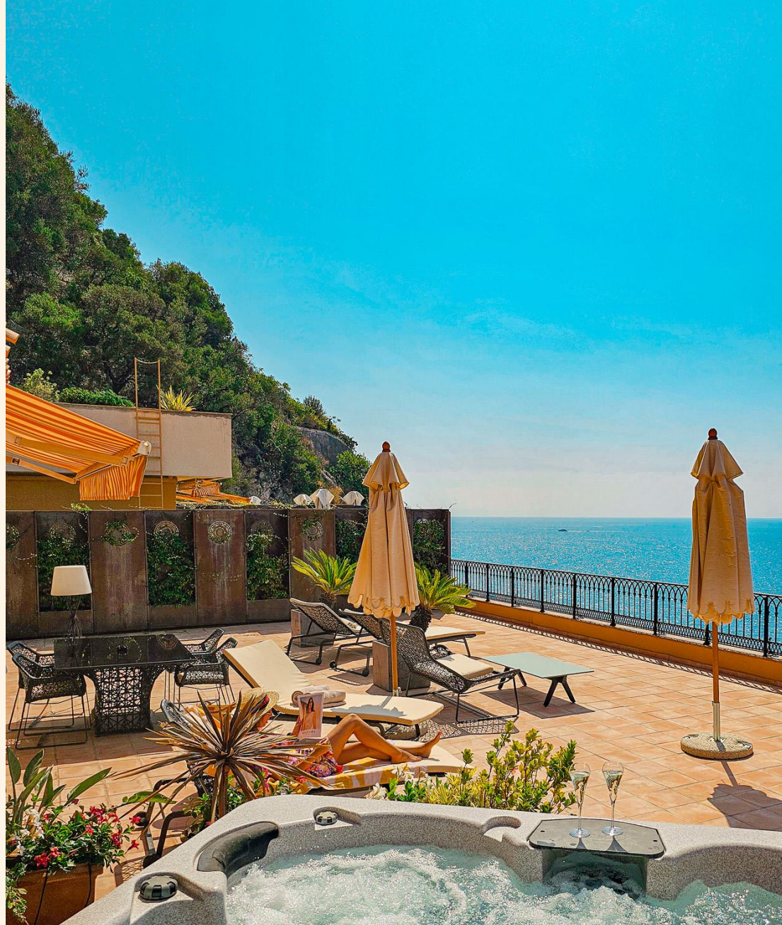
MEDITERRANEAN SUITE - 50 sqm / 538 sqf – Full sea view with private terrace of 137sqm / 1475 sqf with jacuzzi Up to 2 guests – side by side rooms options for families