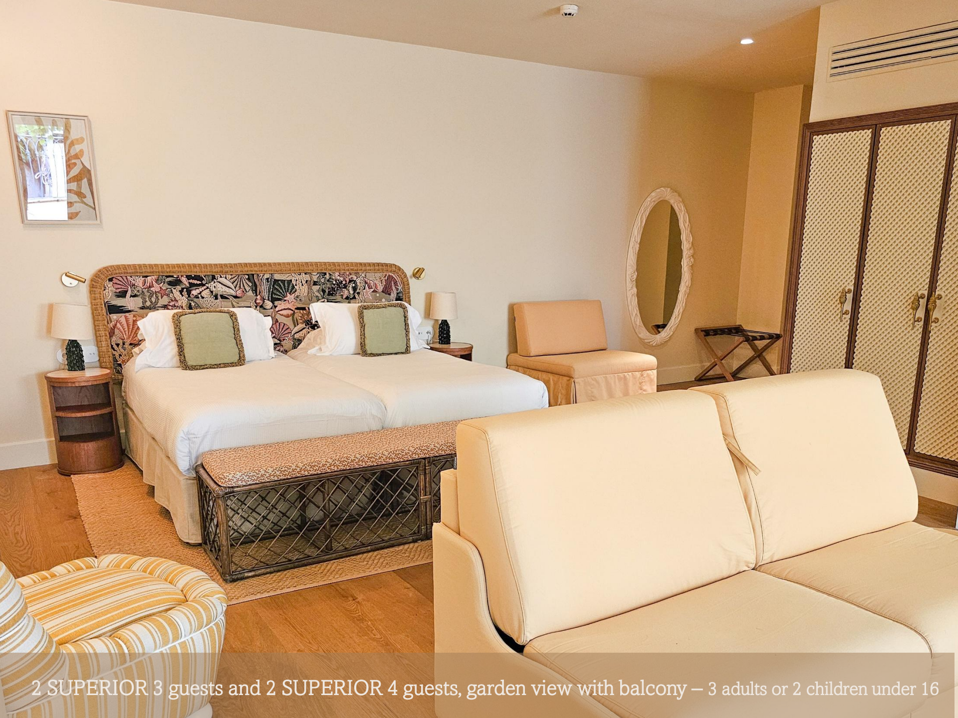
2 SUPERIOR 3 guests and 2 SUPERIOR 4 guests, garden view with balcony – 3 adults or 2 children under 16