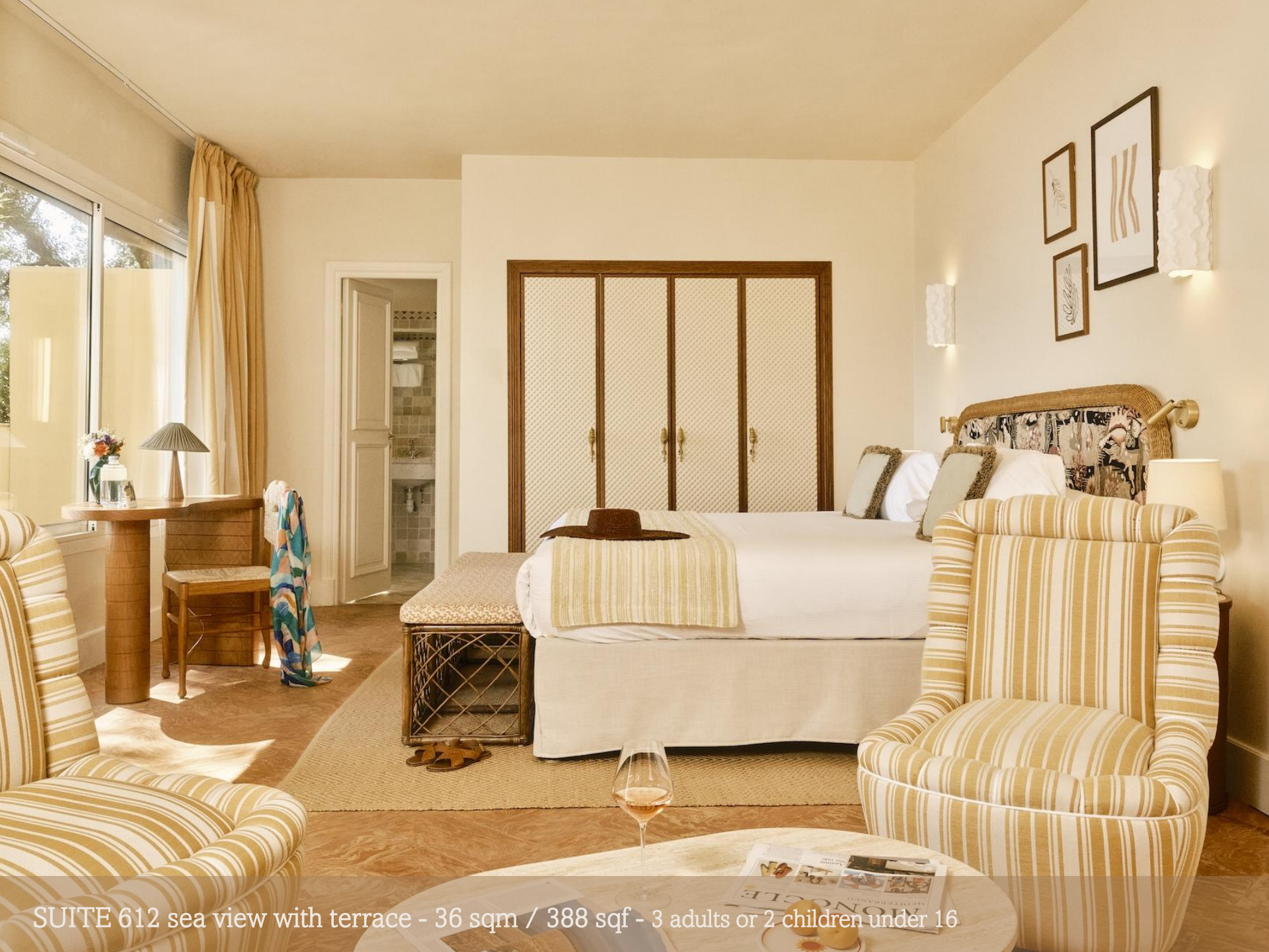
SUITE 612 sea view with terrace - 36 sqm / 388 sqf - 3 adults or 2 children under 16