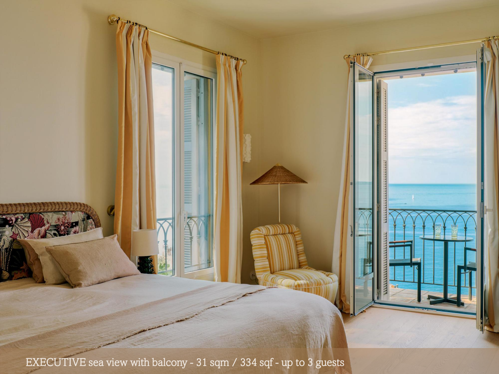
EXECUTIVE sea view with balcony - 31 sqm / 334 sqf - up to 3 guests