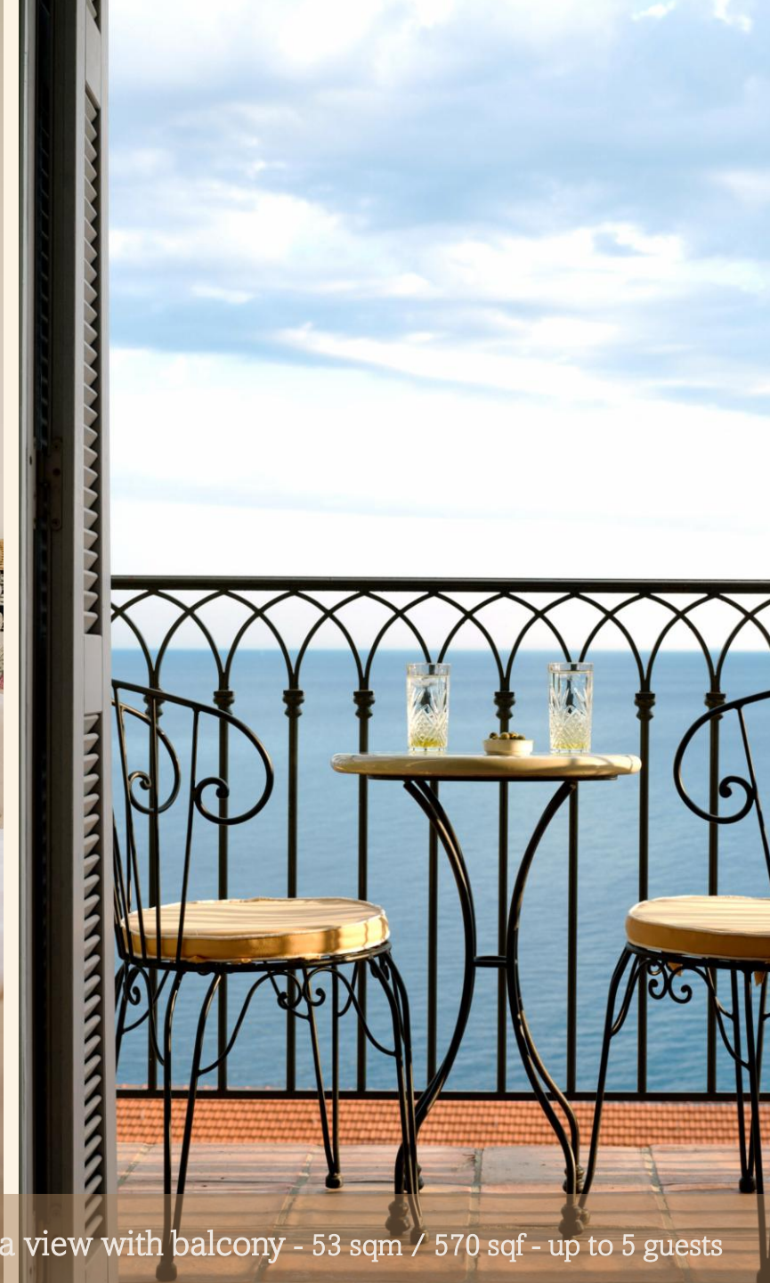
CONNECTING ROOMS: Executive and Superior rooms, sea view with balcony - 53 sqm / 570 sqf - up to 5 guests