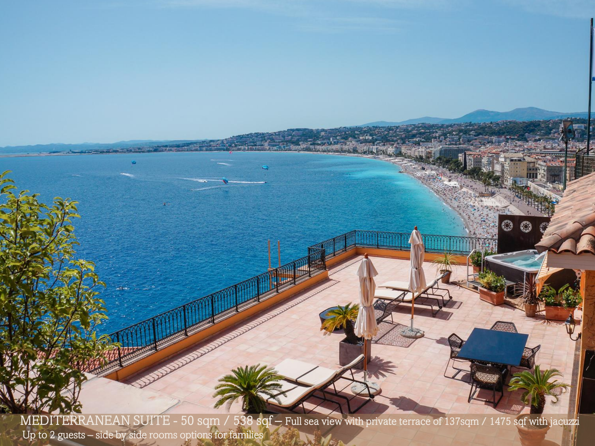
MEDITERRANEAN SUITE - 50 sqm / 538 sqf – Full sea view with private terrace of 137sqm / 1475 sqf with jacuzzi Up to 2 guests – side by side rooms options for families