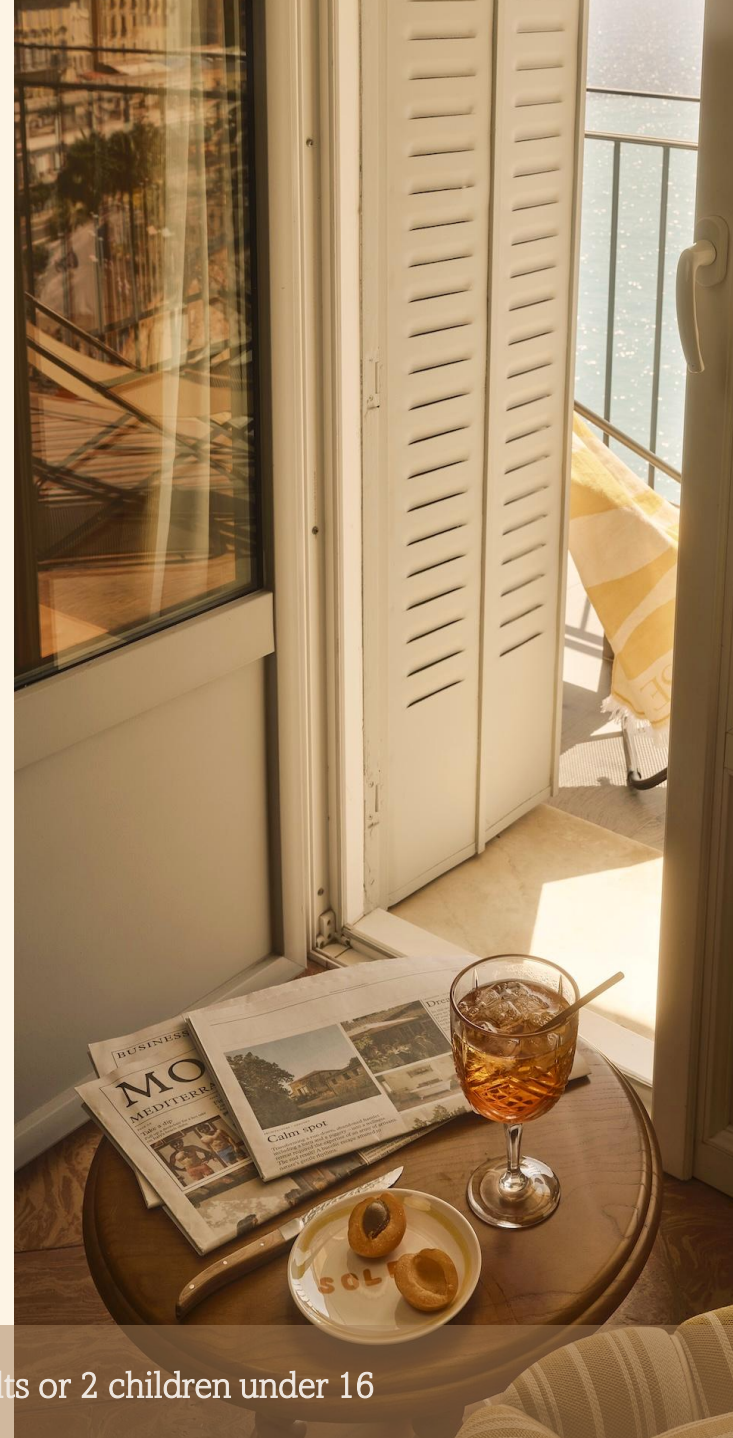
JUNIOR SUITE sea view with balcony - 38 sqm / 409 sqf - 3 adults or 2 children under 16