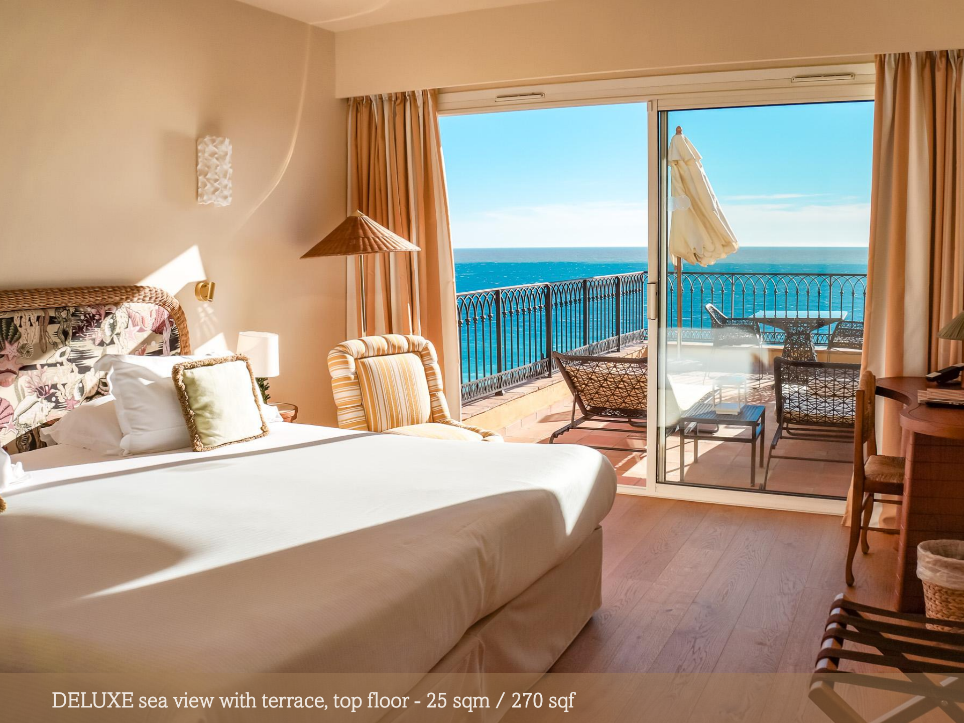
DELUXE sea view with terrace, top floor - 25 sqm / 270 sqf