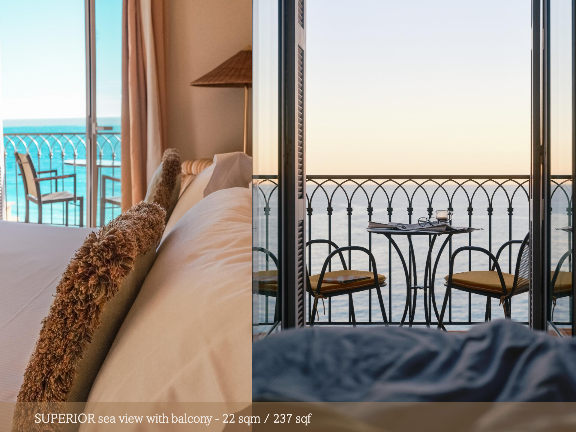
SUPERIOR sea view with balcony - 22 sqm / 237 sqf