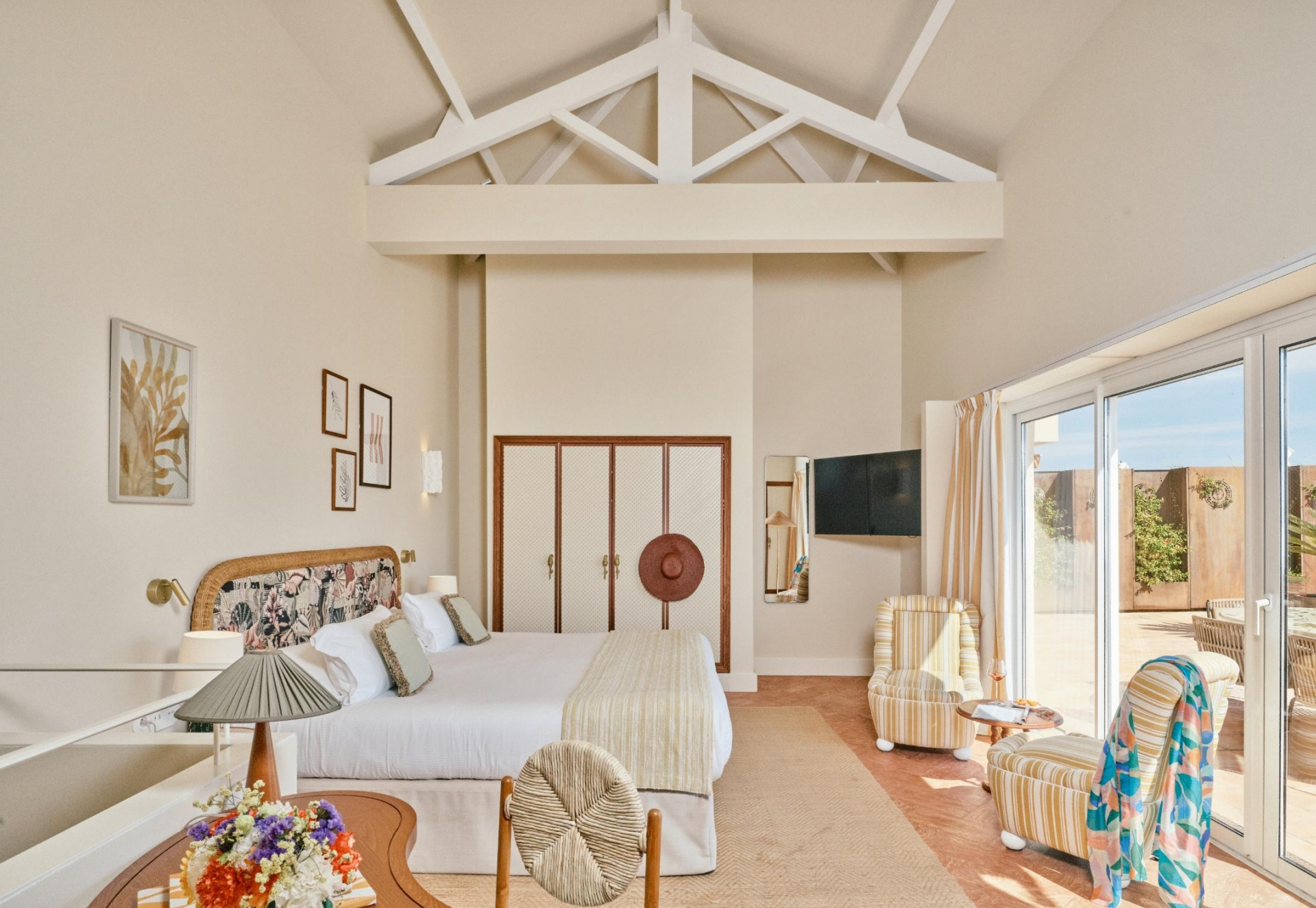
MEDITERRANEAN SUITE - 50 sqm / 538 sqf – Full sea view with private terrace of 137sqm / 1475 sqf with jacuzzi Up to 2 guests – side by side rooms available for families