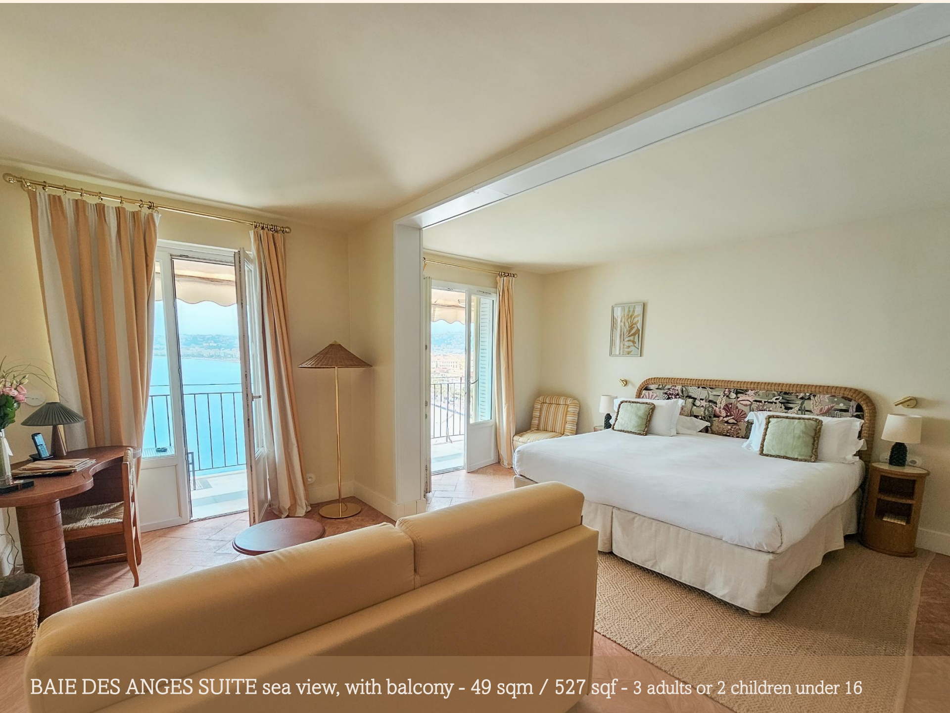
BAIE DES ANGES SUITE sea view, with balcony - 49 sqm / 527 sqf - 3 adults or 2 children under 16