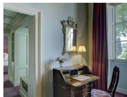
Villa la Massa: interior design