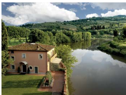
Villa la Massa: Villino building on the Arno

From Monday, May 9th to Saturday, May 14th 2016