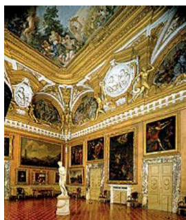
Palazzo Pitti, interior