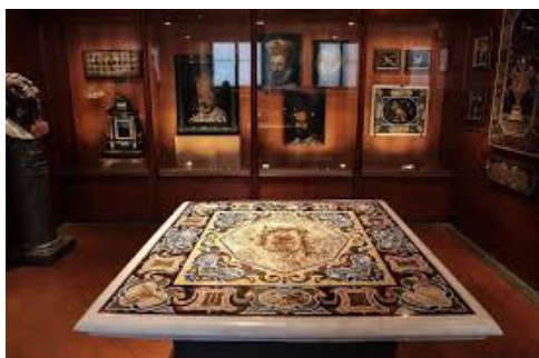
Museo dell'Opificio delle Pietre Dure

Dinners (wine included), except for dinner on Wednesday May 11th, are counted in the program and foreseen at the Hotel: one is a group dinner (the welcome dinner), all the others are individual.