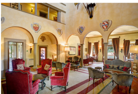
Villa la Massa: the Medicean Hall