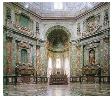
Cappelle dei Principi di San Lorenzo