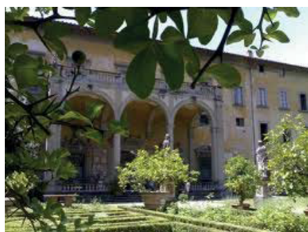
Palazzo Corsini al Prato, Garden